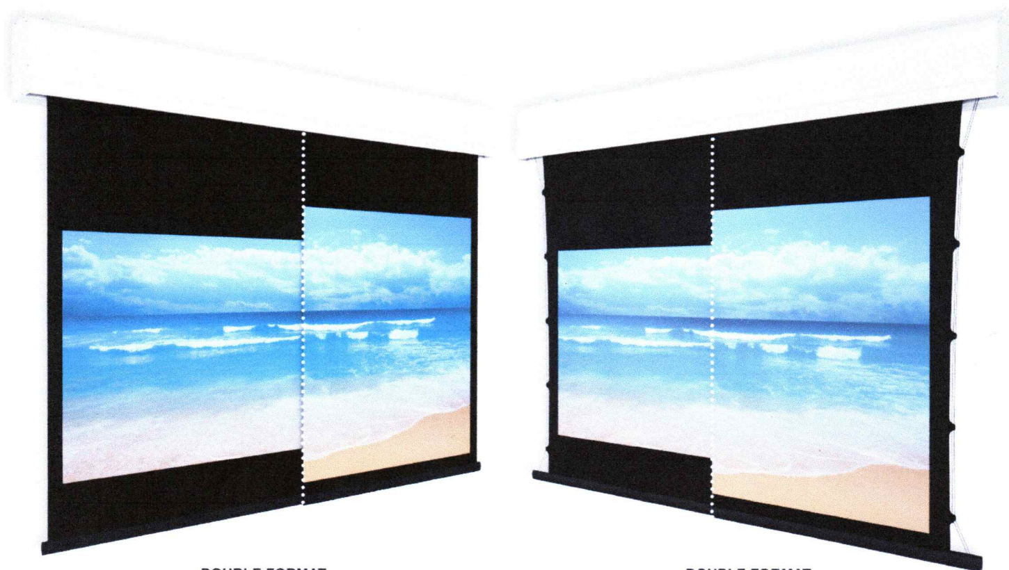
DOUBLE FORMAT HOME CINEMA