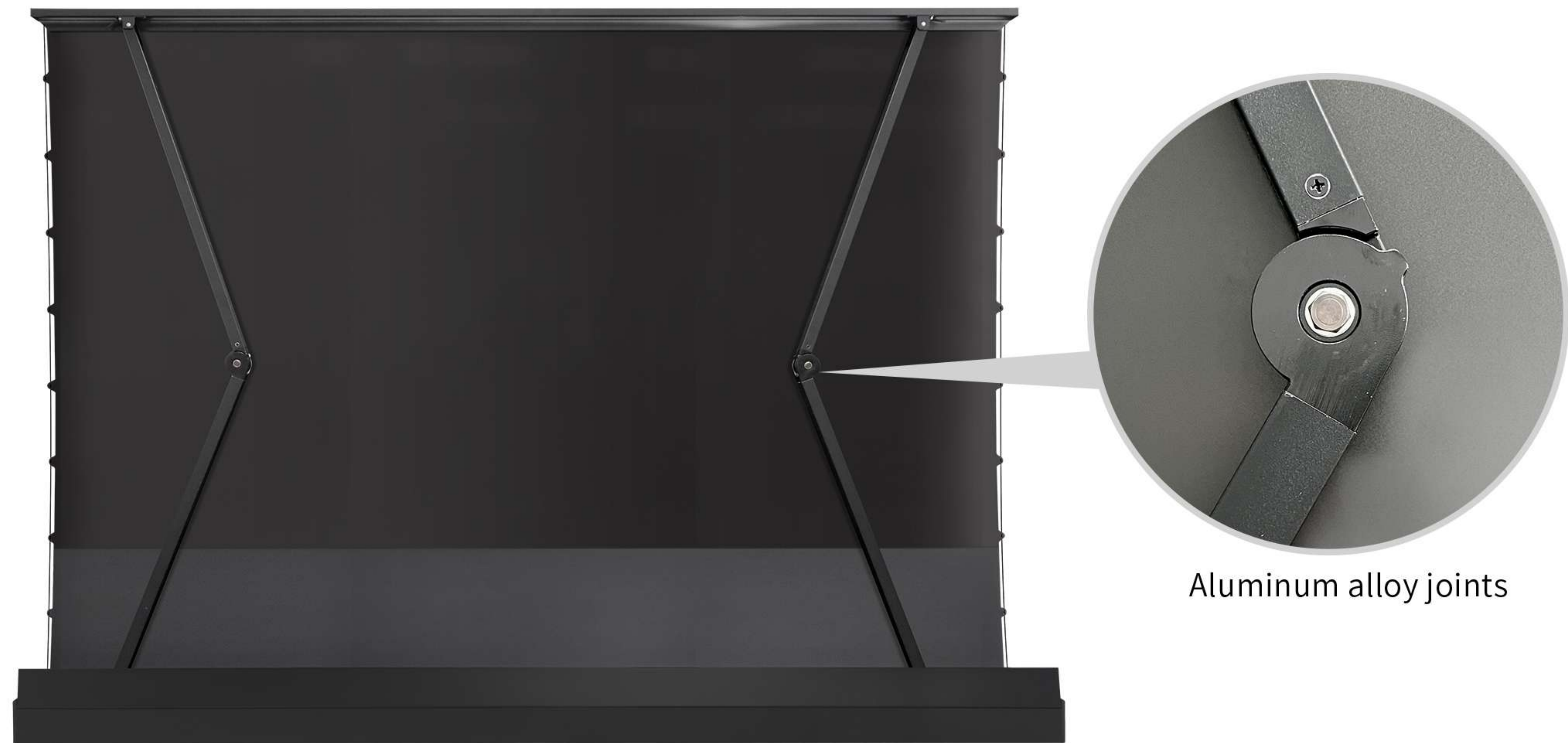
Aluminum alloy joints