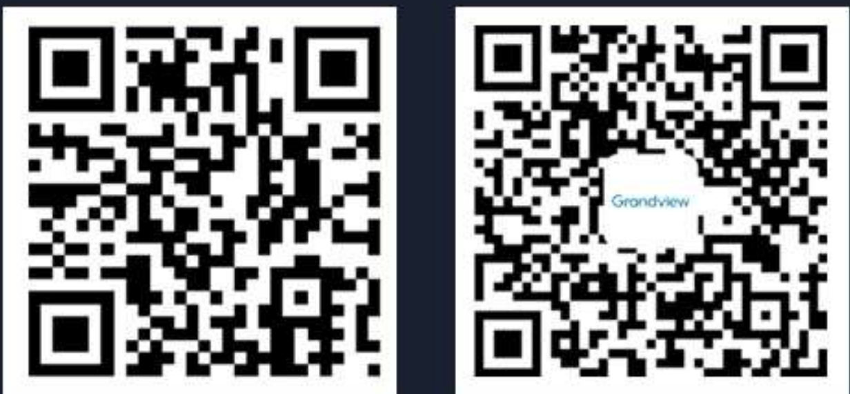
Grandview QR code Grandview wechat QR code