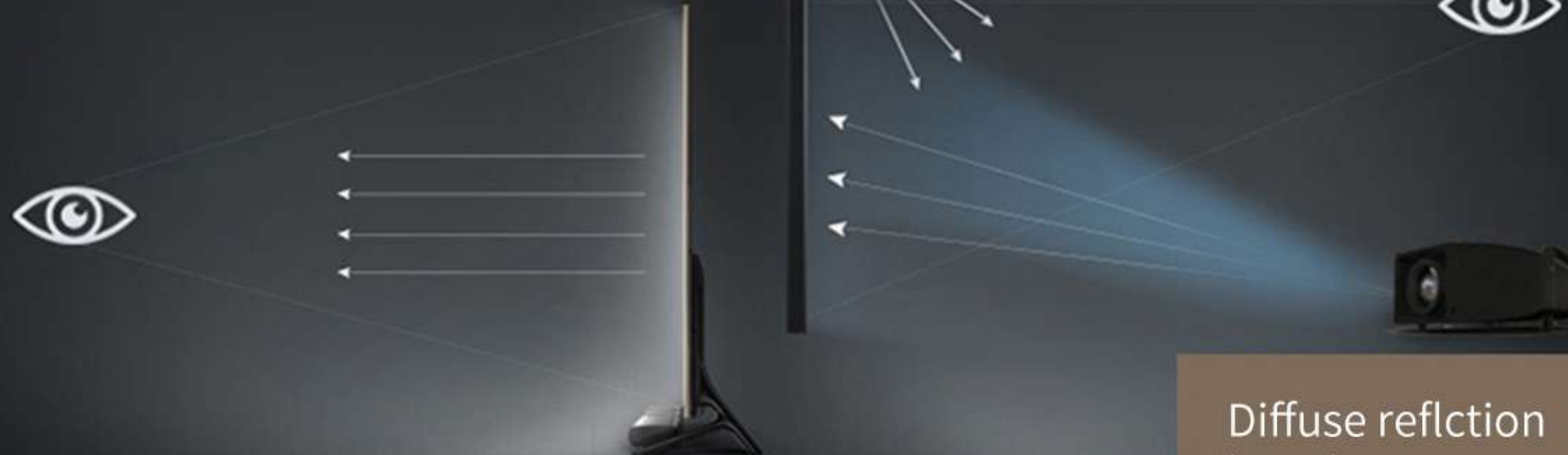
Diffuse reflection imaging

LED screen, Self-luminous direct into eyes