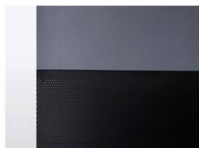
Microporous sound under black edge