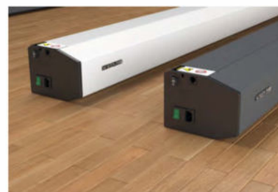
Support AMX, RS485 connection