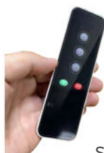
Screen height adjustment