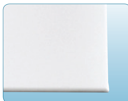
Glance to the corner - Front side view