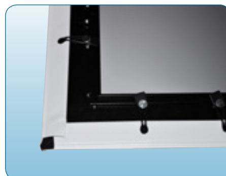
Anchoring system - Rear side view