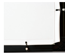
Flat Elastic anchoring system