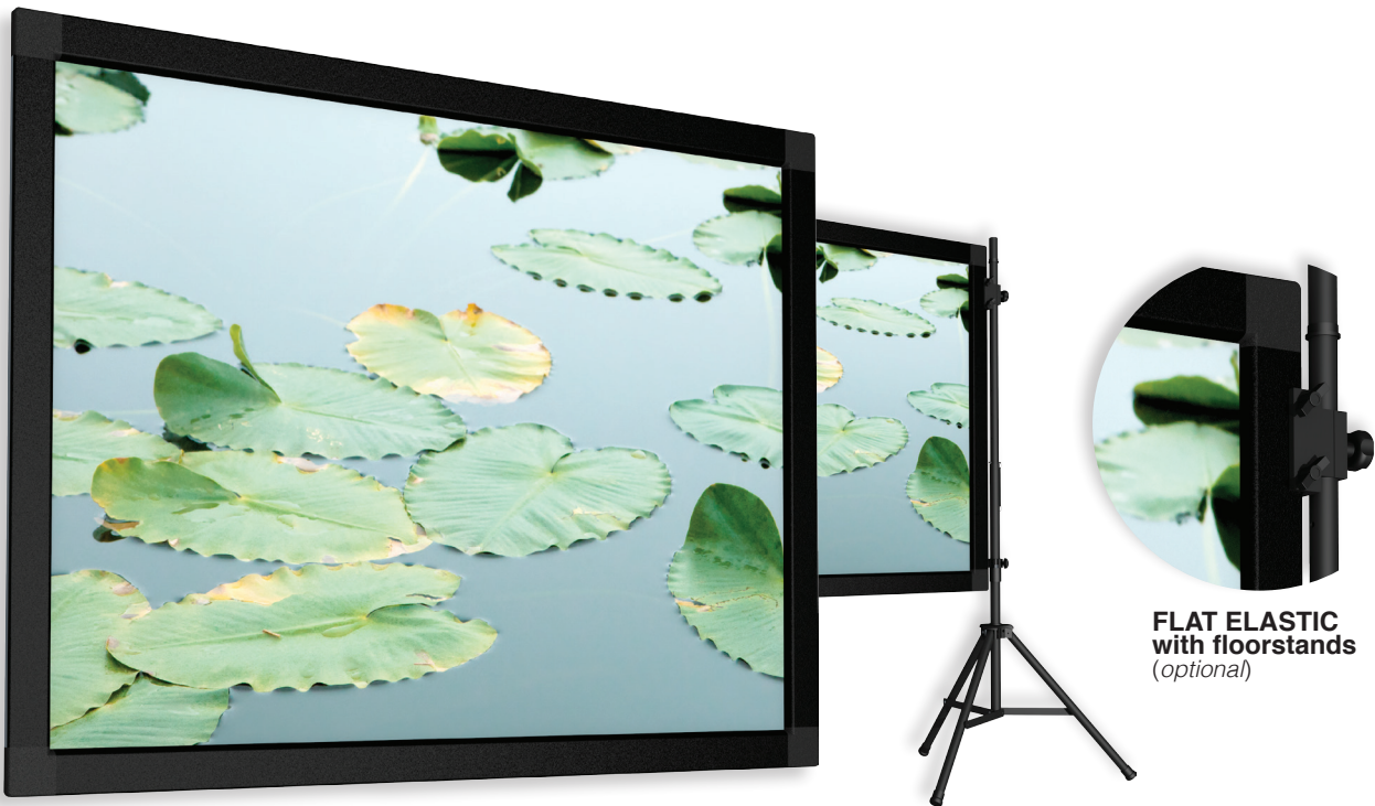
FLAT ELASTIC with floorstands (optional)

FLAT ELASTIC and FLAT PRESS are the right solutions for the installer who needs a frame screen either for rear or for front projection. They bring together high quality standards with a good versatility.