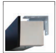
Side bracket (130" ~ 150" are case integrated type) 1 set: 2 pairs

[HD 16:9] Please specify the model code for "x1x" to refer "How to understand the model code".