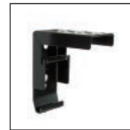
Sliding bracket (Except 130" ~ 150") 1 set: 2 pairs